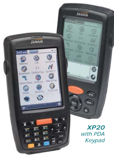
XP20 with PDA Keypad

The XP30 is the world's first fully-featured mobile computer that scans barcodes and runs the latest version of the Palm OS. A brilliant, color, quarter-VGA display and blazing Freescale™ architecture make the XP30 a best-of-breed, rugged, barcode scanning, mobile computer, while its list price makes it impossible to ignore. For customers who want to extend the reach and capability of their mobile Palm applications, the XP30 has the horsepower to execute mission-critical data collection tasks at the point of business activity. And for customers who are ready to switch to the Palm OS for its simplicity and its durability, the XP30 is a platform that pays for itself twice as fast as comparable devices.